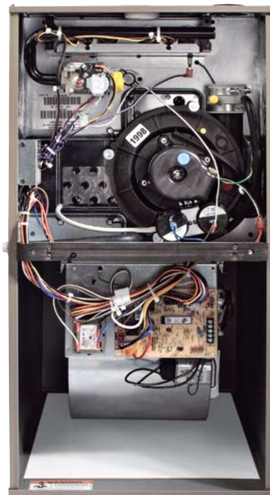
95.5% AFUE Model Shown

Double folded edges—protects your hands while servicing.