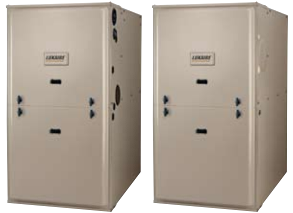
95.5% AFUE Series High-Efficiency Models 80% AFUE Series Mid-Efficiency Models